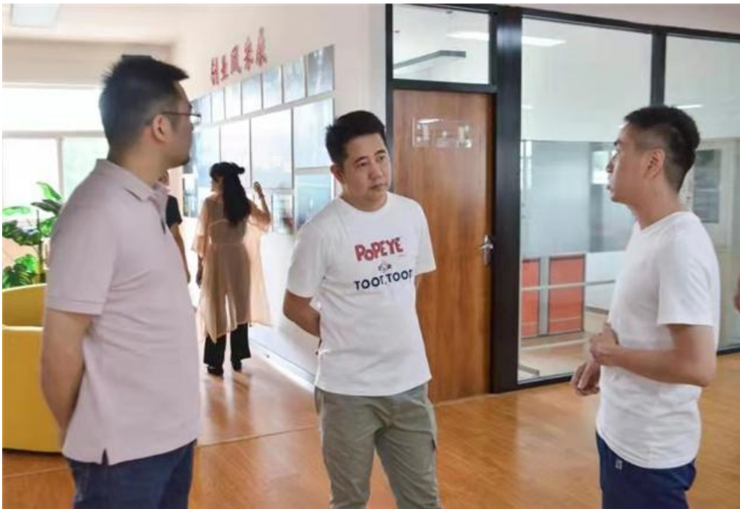
(Figure 4 is a random interview with an internship school)