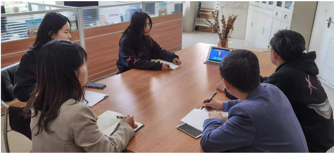
(Figure 3 is an online interview with teachers at the internship school)