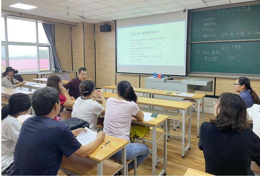
(Figure 1 is an interview with an intern school teacher)